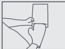
3. PULL PACKAGE OFF OF HAND